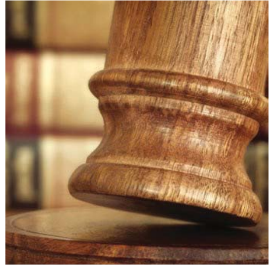
A listing of recent key international tax cases.

Since the rise of e-commerce, an uneven sales tax playing field has emerged between "virtual" retailers and their physical counterparts. Brick-and-mortar retailers in states that impose sales and/or use taxes are legally obliged to collect these taxes from customers who make purchases in their stores at the point of sale and remit them to the state tax authority. However, if a resident of the same state chooses to purchase the same item from an online retailer or catalog seller based out-of-state, sales tax usually goes uncollected by the vendor because they do not have a physical presence, or tax nexus, there.